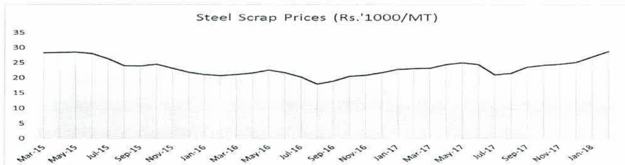
Table 4: The price movement of steel scrap for past 3 years

per MT during FY15 to Rs. 22,588 per MT during FY16, registering a decline of 20%. But the steel scrap prices started to improve from September, 2016 and have as on February 28, 2018 reached a level of Rs 28,750 per MT. The group also faces forex risk, as payment to be made by the firm to the ship supplier depends on the USD to INR exchange rate. There is risk of difference in the exchange rate at which LC is opened by the firm and exchange rate at which actual payment is to be done exposing its profitability to adverse foreign exchange fluctuations.